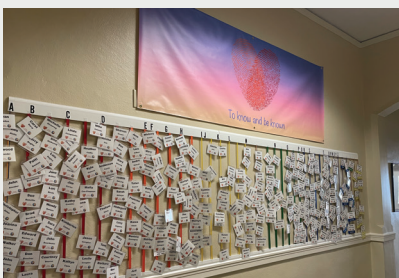
Name badges are one way we get to know each other better